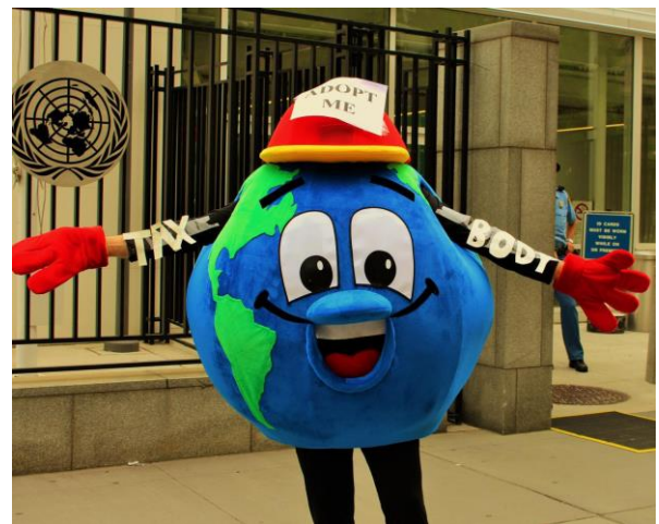
Figure 2: Lobbying for an international tax body

No development can be financed without taxes. A progressive tax system depends on taxing rich more than the poor. It can help investment in infrastructure, improve governance, reduce corruption. However, globally there are very low levels of corporate and income tax. Countries compete to offer lower taxes until they give tax breaks to people in a position to pay. Economists say that there will only be Foreign Direct Investment (FDI) if there are low taxes, but FDIs depend on local markets and skill levels in countries. Further Special Economic Zones (SEZs) are given tax (and labour) exemptions. There are global tax losses in extractive industries. Illicit financial flows exploit tax loopholes to the point where 1 trillion USD is lost to every year. Asia accounts for nearly half of this - USD 482 billion – and China alone one-fourth. Tax is considered the traditional MOI for development and Target 17.1 talks about strengthening domestic resource mobilization. UNCTAD estimates it will take USD 3.3-4.5 trillion annually for developing countries to meet SDGs.