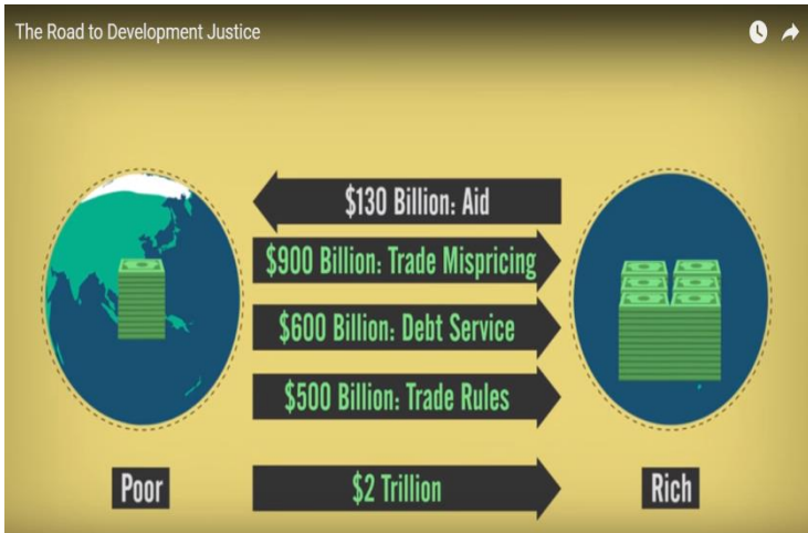
Figure 3: Road to Development Justice (APWLD video)

The global north continues to bleed the global south. The value of ODA has remained unchanged for 5 years. More resources have been flowing out of developing countries than in. ODA's role is being downplayed, and MOI focus is moving to FDI, remittances and domestic resources. Donor countries are introducing capacity building and technical assistance, undermining ownership. OECD calculation of ODA contributing to SDGs includes scholarships and peacekeeping activities (legitimizing military expenditure). ODA to PPPs is also increasing, favoring commercial interests of donors.