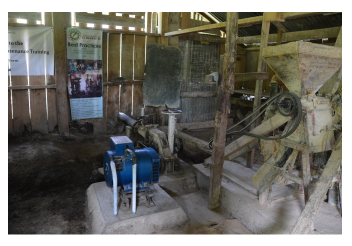
The Microhydro powers the Buneg rice mill benefitting the Tinggian indigenous peoples in Buneg, Abra in Cordillera, northern Philippines.

At the community-level , indigenous-led approaches to renewable energy production can inspire further human rights-based action on the ground. Such initiatives are more likely to be effective in reducing poverty and serving the self-determined development goals of communities. Experiences with community-based micro hydro power in Asia have had promising results. The Community-Based Renewable Energy Systems (CBRES) in the Cordillera region of the Philippines includes a number of community-led micro-hydro power developments that have had numerous sustainable development benefits for the community, including a reduction in dependence on wood for lighting and a reduction in the work burden of women through the use of water-powered rice pounders. [14] These energy systems are sustainably financed through contributions from the local community. Communities in Sabah and Sarawak in Malaysia have designed micro-hydro systems that do not limit river flows by more than 60%, ensuring that river ecosystem functions are not negatively impacted. This award-winning initiative emphasises community participation all aspects of project conceptualisation, design, installation, and implementation. Community benefits include electricity access, clean water, and the powering of agro-processing equipment. [15]